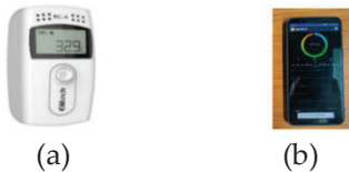
Figure 1: (a) Elitech RC-4HC, (b) Light Meter Application

The physical measurement assessment method involved using equipment to collect three environmental data points: temperature, relative humidity, and luminosity. Both environmental stress and worker data were gathered for this study. Three workers from different industries were assigned to Company A, Company B, and Company C. Figure 1(a) displays the temperature and relative humidity equipment, while Figure 1(b) shows the light meter application used in this study.