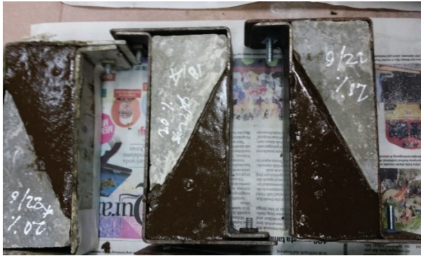
Figure 1: Molding of geopolymer mortar