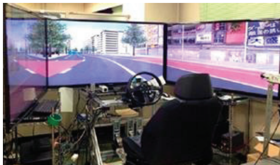
Figure 1: Driving simulator

The study was conducted in the driving simulation as shown in Figure 1 [22]. The driving simulator consists of three liquid crystal displays (LCD) on the left, right, and in front of the driver seat. Two speakers are on the right and left of the driver seat. The simulation software used was UC-WIN/Road ver. 10.1.2 developed by FORUM 8. The software equipped with an excellent virtual reality creation and editing function for road alignments, cross section, terrain, building, traffic setup, model setup and others. The drivers were provided with the visual and sound cues in order to fully immerse into the driving task. Realistic road, engine and wind sound are played synchronized with the display over a sound system.