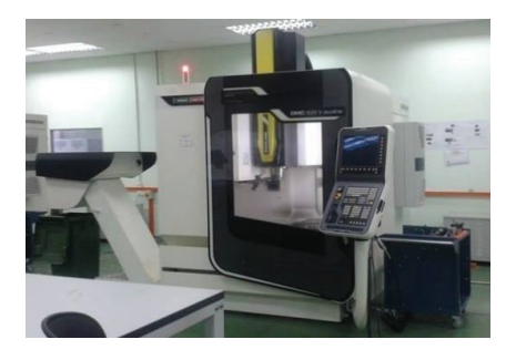
Figure 1: DMG 365 V Ecoline CNC machine

The experiments were carried out on 3 axis CNC milling machine in dry condition as shown in Figure 1. AISI D2 tool steel was selected as workpiece which was prepared at 100 mm width × 100 mm length ×10mm thickness size. The programming for drilling process has been done using Catia V5 software. Figure 2 shows the specimen of AISI D2 steel after drilling process. Details experimental procedure can be referred to Osman [11] and Ammar [12].