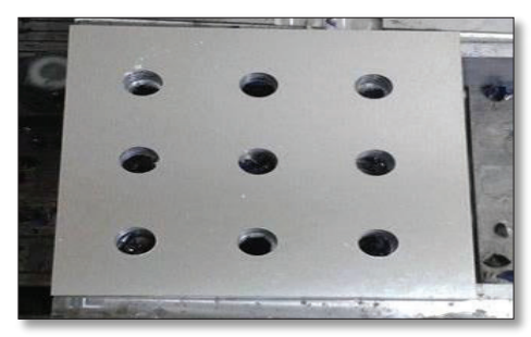
Figure 2: AISI D2 after drilling process