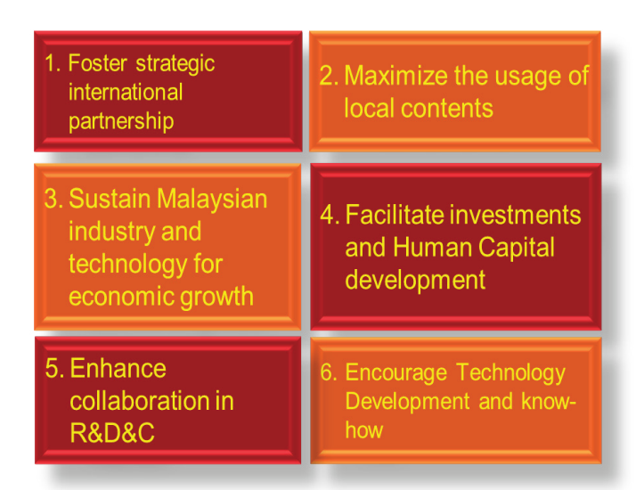
Figure 1: Offset policy objectives

Malaysia has been practising offset program since 1987 leveraging on defence assets procurement. Since then, offset program was taken as part of public procurement processes and has evolved to become Industrial Collaboration Program (ICP) which currently leveraged as one of national economic development tools.