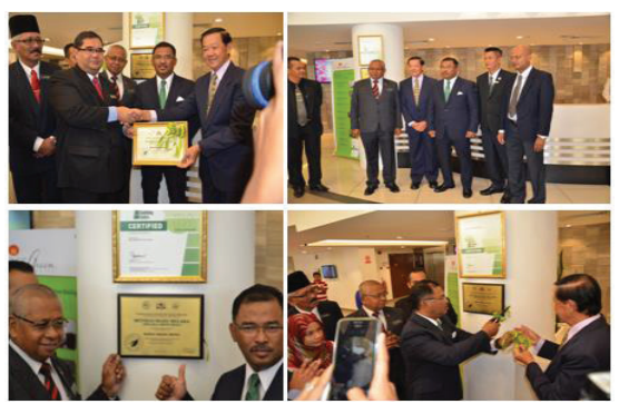
Figure 2: Kings Green Hotel received Melaka Green Seal award [14]

By adopting green electricity such as a Photovoltaic system (PVS) or solar electricity in the hotel building may help the hotel providers reduce their operating cost [15]. PVS will contribute to low environmental impact because it provides green, renewable power by exploiting solar energy by reducing carbon dioxide (CO2) emissions into the atmosphere, thus encouraging climate mitigation. Therefore, Melaka will pave the way for the state to become a zero-emission city by promoting electric buses and green hotel concept.