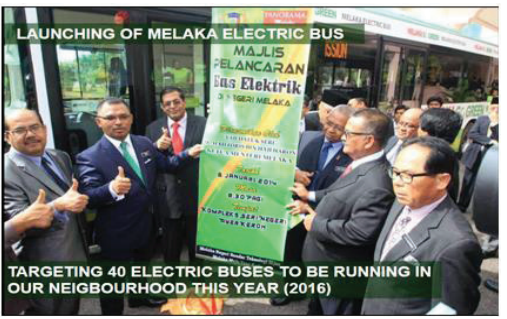
Figure 1: Launching ceremony of electric bus by CM of Melaka [13]

Assistant Engineer 1 asserted that tourists who visited Melaka tended to stay in green hotels. MGTC has also been given recognition through the awarding of certificates (Melaka Green Seal) to the buildings that fulfil green criteria. It is a recognition for hotel owners and guests who are showing their concern for the environment, and both are playing vital roles in making the hotel industry more sustainable. Figure 2 shows the Kings Green Hotel at Ayer Keroh, Melaka received the Melaka Green Seal in 2015 [14].