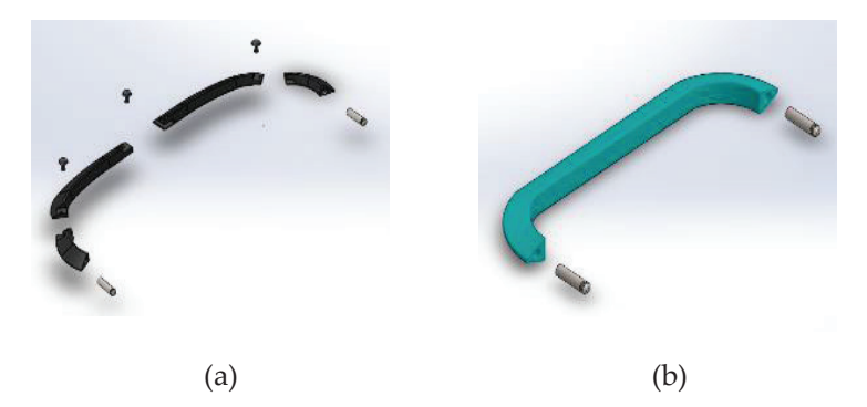
Figure 3: Design Comparison of front bar, (a) original and (b) redesign

Based on Table 1, the minimum part criteria for the front bar A and front bar B is 2 meanwhile for handle the value is 1. For the securing method, rivet had been chosen because both of front bar A and front bar b are connected together and can be moved about 60 degrees with the rivet secured. The symmetry (the orientation of product) chosen for the front bar and handle is only one way of alpha and also one way for beta symmetry.