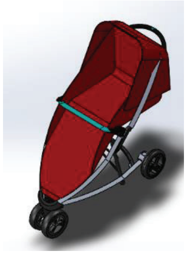
Figure 4: Redesign of front bar for sweet Cherry SCR8 stroller

The design had been improved from the original design to new design in order to compare the efficiency before and after analysis. The design had been simplified to make it more reliable in term of manufacturing cost and assembly time. Figure 4 shows the redesign of the Sweet Cherry SCR8 stroller.