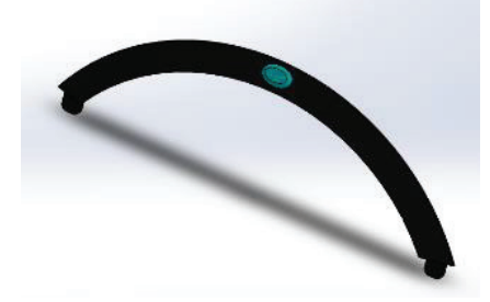
Figure 6: Exploded view of handle sub-assembly and bill-of material

Originally, handle part as shown in Figure 6 is not connected to the folding system of the stroller. But after the redesign, the button to fold the stroller had been changed to the handle to make it easier for a user to fold the stroller just by using one hand only. This is because, for the original design, user needs to use both hands to conduct the fold latch (right and left side) simultaneously to fold the stroller