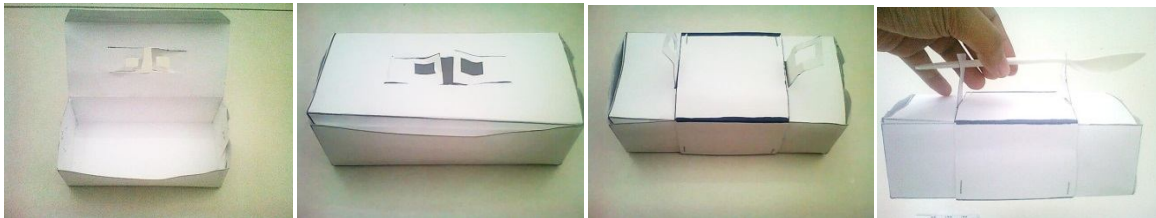
Figure 4: Nasi Lemak packaging prototype

The selected concept was the 3rd concept. It was chosen through concept scoring method. This concept was chosen due to its better design feature that made it convenience to pack Nasi Lemak and an incorporation of a holder to hold fork and spoon. The next step was to produce the prototype. A typical paper was used to develop the prototype. The material selection plays an important role. It is best to select material that is easy to recycle or dispose and most importantly biodegradable to gear toward sustainability. Sustainability of a product is derived from the material. The material needs to be the one that can be consumed and get easily. In other words, it will not interfere in the future needs. As a product to pack food items, the material must be safe and free from hazards of chemical reactions. In addition, the number of parts is also important upon redesigning new product. In design for environment concept, the lesser the part the better it is. Figure 4 shows the the prototype.