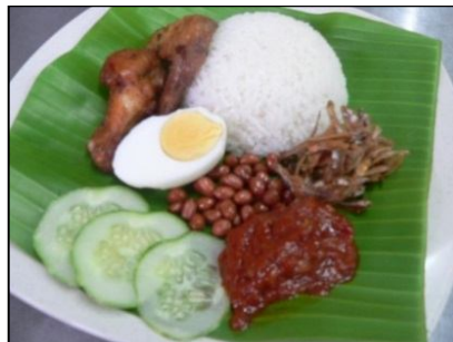
Figure 1: A typical Nasi Lemak

Nasi Lemak is a traditional Malay food and one of the famous cuisines in Malaysia for ages. It is available at any time, especially for a breakfast menu. Indeed, Nasi Lemak is the most preferred breakfast choices. It consists of 5 'standard' ingredients namely rice, sambal , egg, slice of cucumber and fried anchovies with nuts. In English, a direct translation of Nasi Lemak is creamy rice, and 'creamy' refers to a creamy texture of the coconut milk which is the main ingredient for this cuisine. The rice is cooked and sometimes steamed with coconut milk. Another main ingredient is the sambal or sauce which ranges in terms of its spiciness. Figure 1 shows a typical Nasi Lemak .